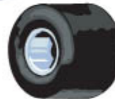
WIDE-RIM RACING WHEELS