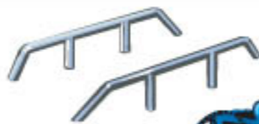
FRONT & REAR BUMPER BRACES