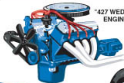
"427 WEDGE" ENGINE