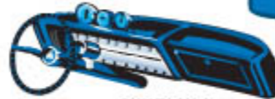
SUN TACH & GAUGE CLUSTER